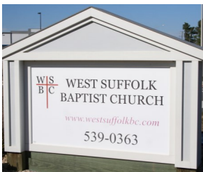
West Suffolk Baptist Church

The views and opinions from the contributors to this newsletter do not necessarily reflect those of West Suffolk Baptist Church or its leadership.