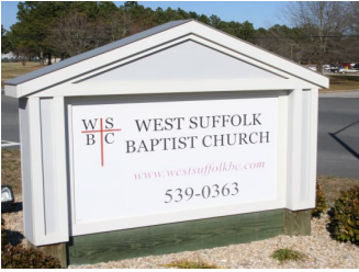
Volume 2, Issue 11