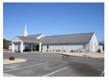
Volume 4 Issue 5

"Thoughtfully Reformed - Redemptively Relevant"